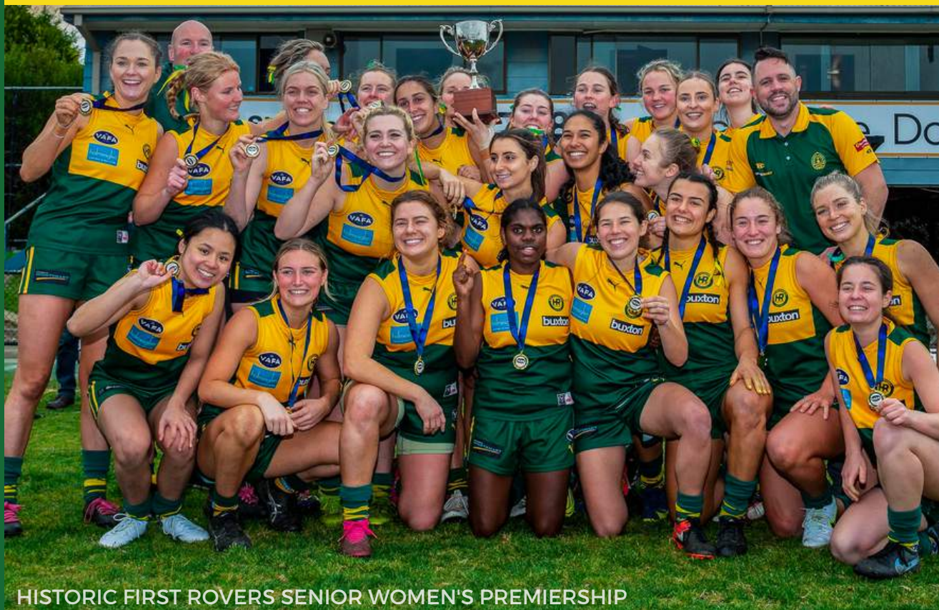
HISTORIC FIRST ROVERS SENIOR WOMEN'S PREMIERSHIP